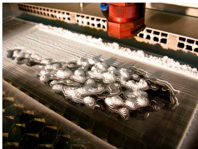
A laser cutter is shown here engraving a plastic plate with a map representing by isolines the density of homonymous populated places in Austria. Lower densities appear at the country’s borders, where German placenames coexist along toponyms influenced by Slavic and Romanic languages.