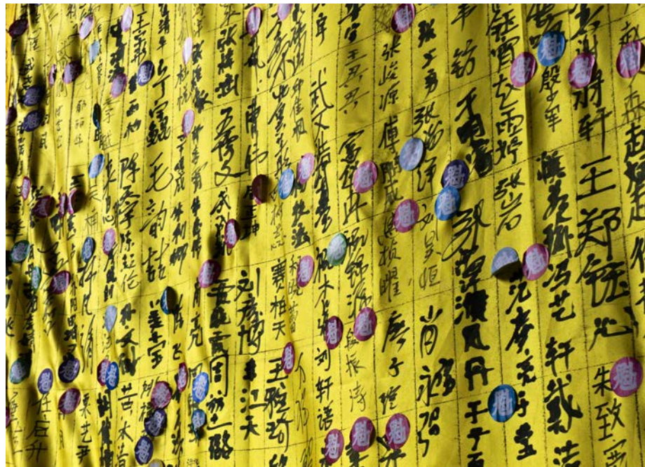
STUDENT INVOCATIONS OF CONFUCIUS