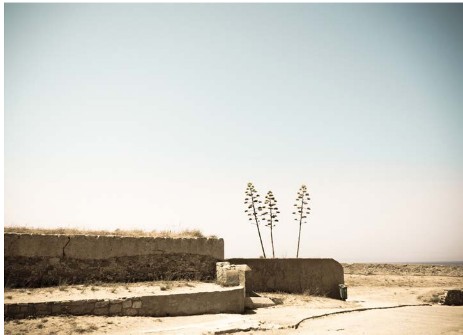
THE DESERT OF THE TARTARS